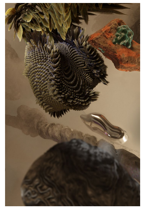
The Andrean Information Age